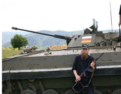
Fig. 1. Dr. Aleksandr Dugin with a Kalashnikov in front of a tank of the South Ossetian insurgent army. June 2008, South Ossetia.